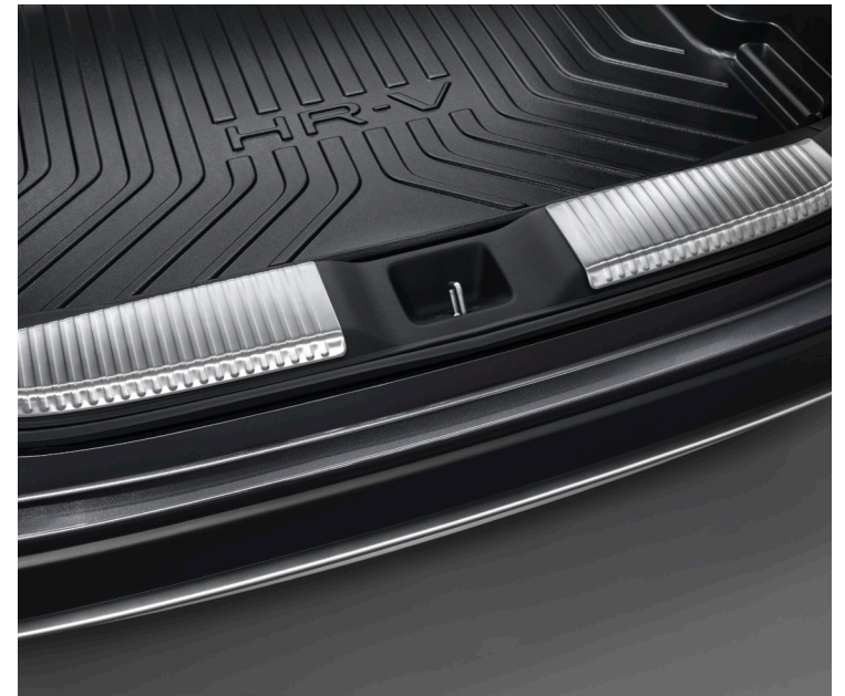
REAR PANEL LINING COVER