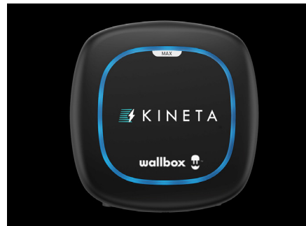
WALL BOX CHARGER (AC 11kW)