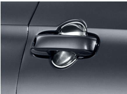
DOOR HANDLE PROTECTOR